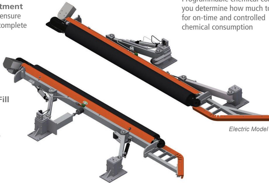
Electric Model Shown

The soft-tipped nylon brushes easily conform to all tire sizes, including the most rugged truck tires on the road today, to deliver the perfect shine every time.